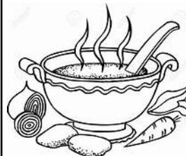
Table of Plenty

We are in desperate need of volunteers for our Table of Plenty program.