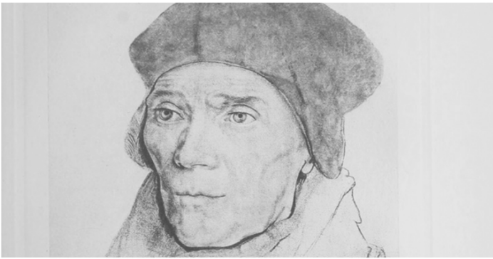
Saint John Fisher