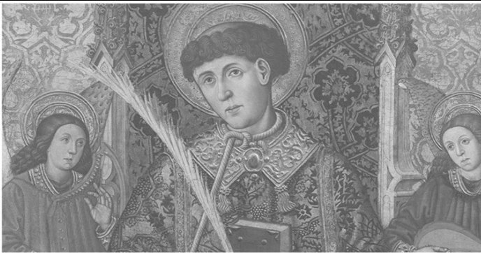
Saint Vincent of Zaragoza Saint of the Day for January 22