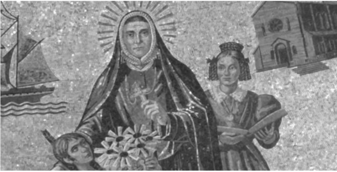
Saint Rose Philippine Duchesne Saint of the Day for November 20