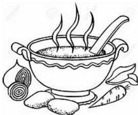
Table of Plenty

We are in desperate need of volunteers for our Table of Plenty program.