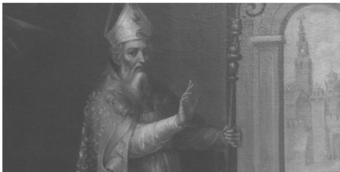
Saint Leander of Seville